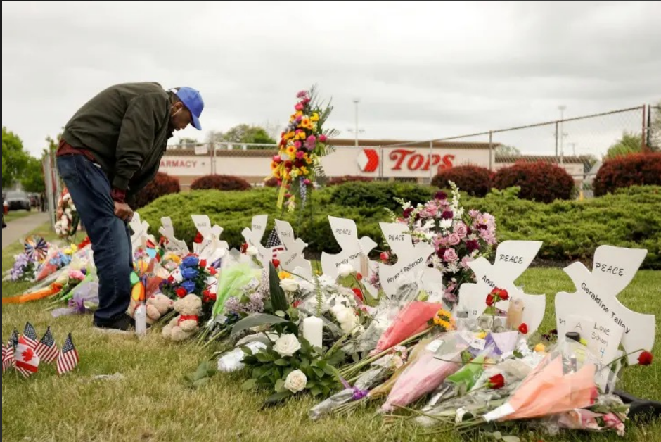
Tops Massacre, 5.14.22